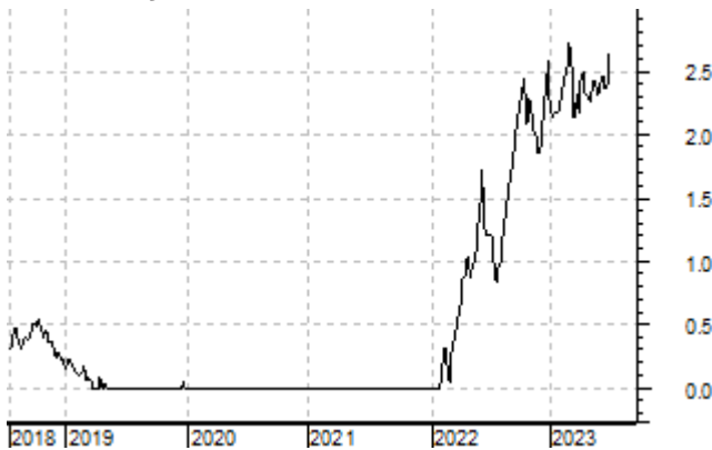
Germany Government Bond Interest Rates