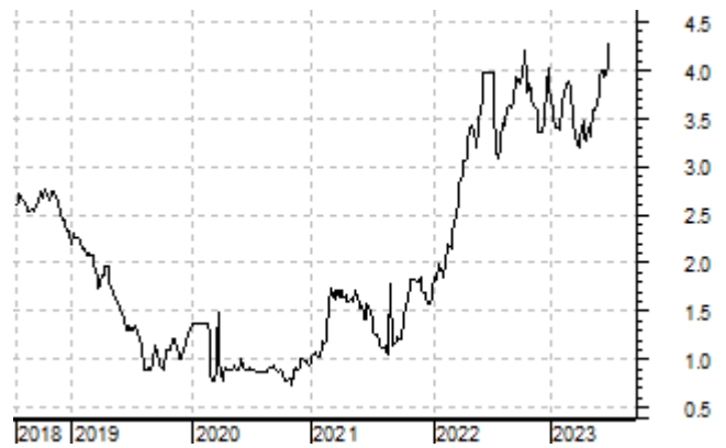
Australia Government Bond Interest Rates