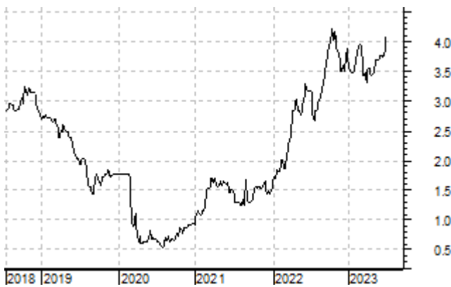
US Government Bond Interest Rates