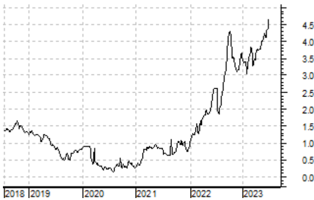
UK Government Bond Interest Rates