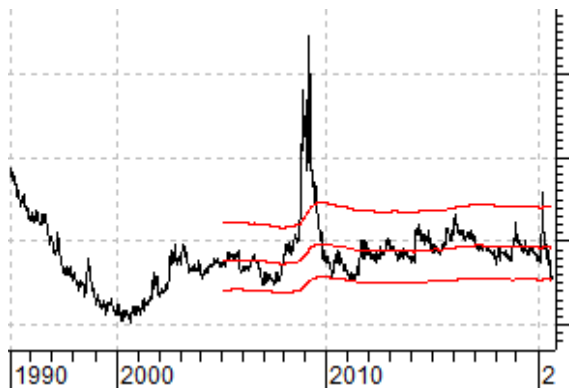
United States Dividend Yields