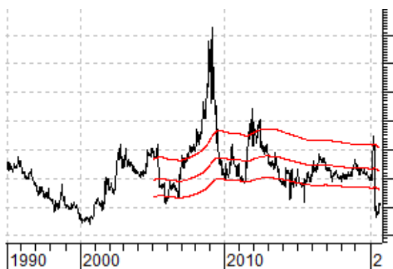
France Dividend Yields