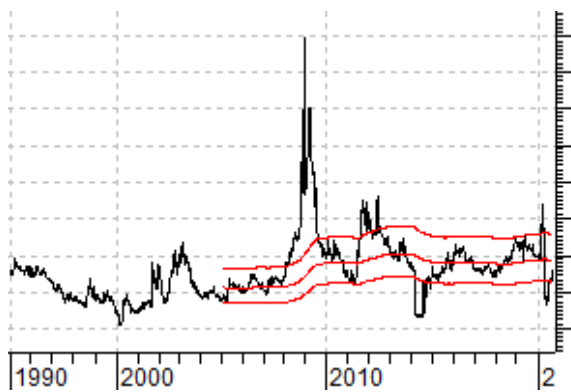
Germany Dividend Yield