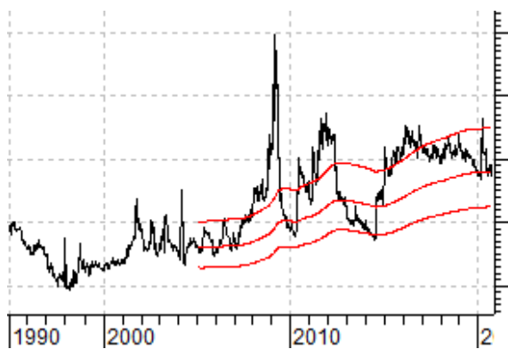
Switzerland Dividend Yields