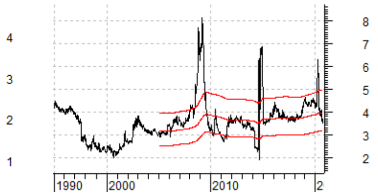
United Kingdom Dividend Yields