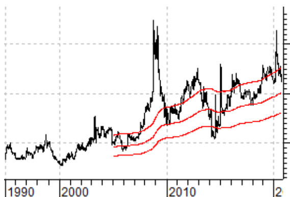
Japan Dividend Yields