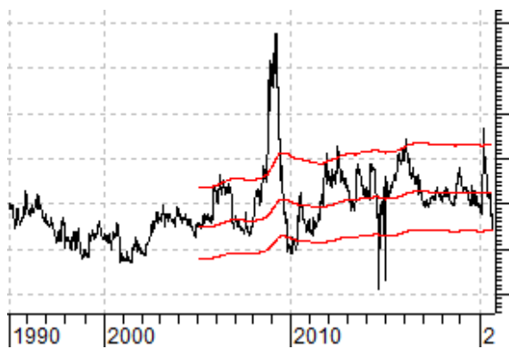
Australia Dividend Yield