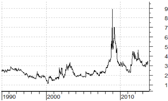
Germany Dividend Yield