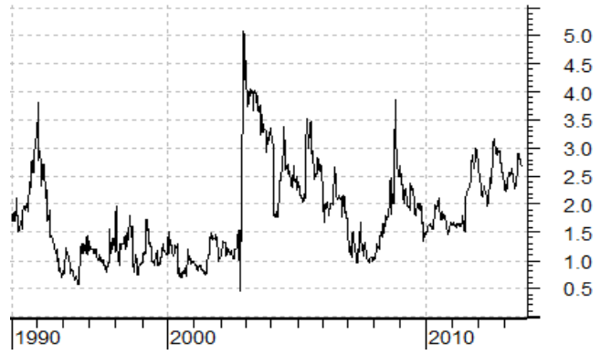
China Dividend Yield