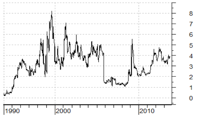
Brazil Dividend Yield