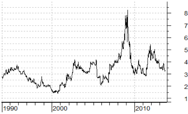
France Dividend Yield