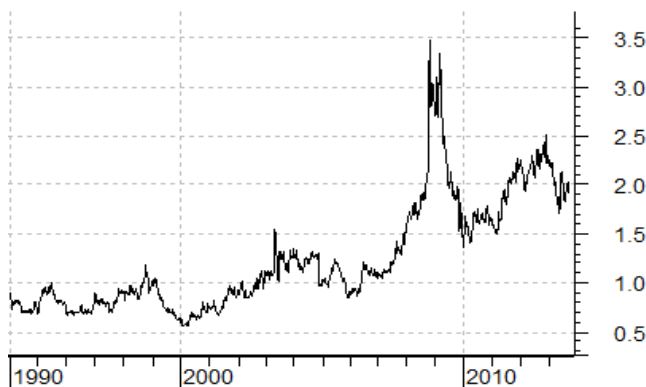
Japan Dividend Yield