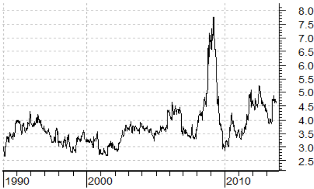
Australia Dividend Yield