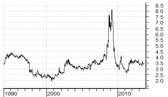
United Kingdom Dividend Yield