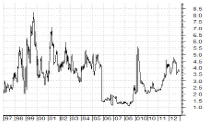
Brazil Dividend Yield