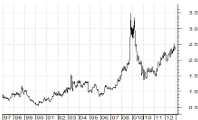
Japan Dividend Yield