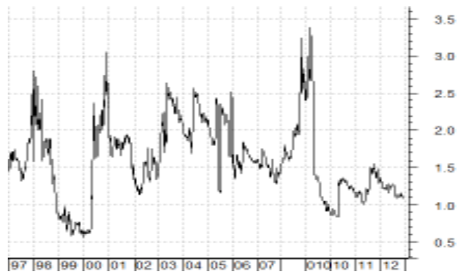
South Korea Dividend Yield