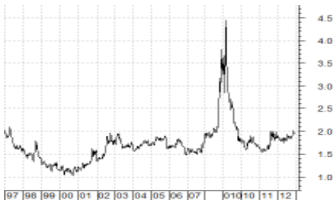
United States Dividend Yield