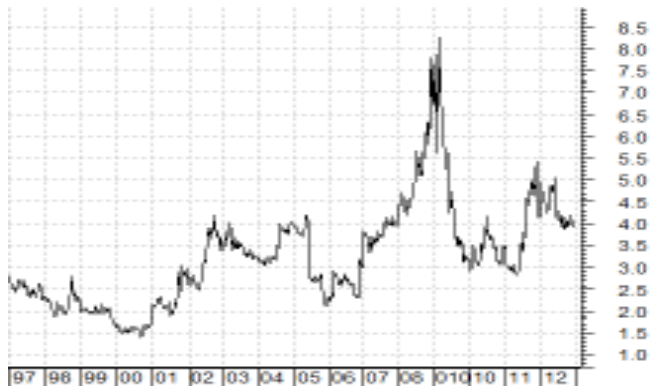
France Dividend Yield