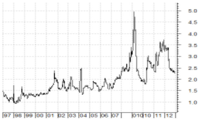
Switzerland Dividend Yield