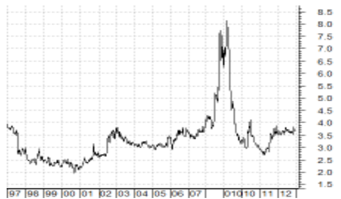
United Kingdom Dividend Yield