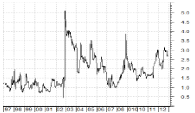
China Dividend Yield