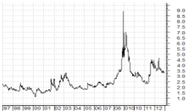
Germany Dividend Yield